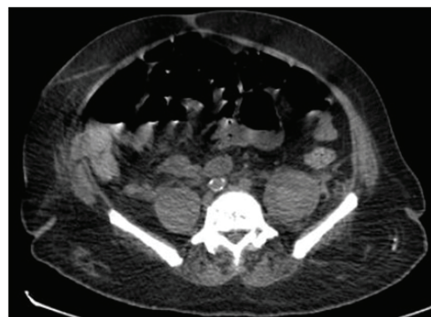
Figure 4. There are heterogeneous organized collections indentified along the right and left psoas muscles causing focal contour bulge representing hematoma, minimal fat stranding surrounding the psoas muscles, more significant on the left side.