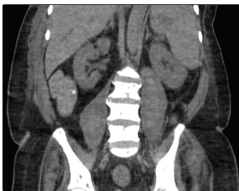
Figure 3. There are heterogeneous organized collections indentified along the right and left psoas muscles causing focal contour bulge representing hematoma.