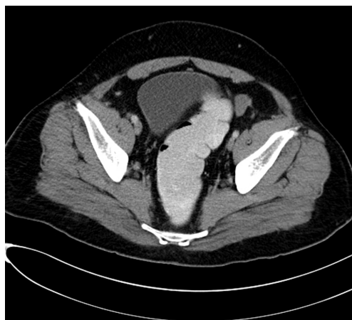
Figure 3. Small oval and homogenous structure is seen within the left aspect of the hemipelvis just adjacent to the inguinal ring which represents a small atrophied left testicle with no masses.

40 years [2]. These tumors carry a favorable prognosis due to their sensitivity to radiation and chemotherapy [2].