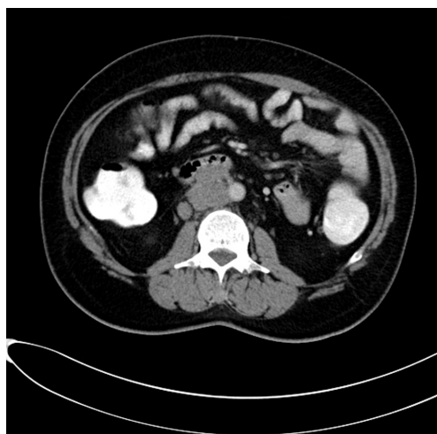
Figure 4. There are multiple homogenous and matted lymph nodes metastasis located within the right Para-aortic region in close relation to the right renal hilum.